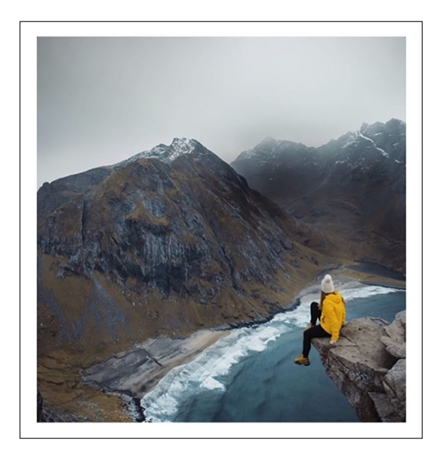
Figure 3. DN enjoying the mountains.

feature of digital nomadism. In line with Müller's (2016) research, DNs who took part in this study valued 'labour productivity' as an important feature in the DNs' lifestyle. Rather than prioritizing leisure over work, most participants reported to pursue a better work–leisure balance with the DNs' lifestyle as opposed to a nine-to-five job. The achieved balance was manifested in (posting about) having non-repetitive leisure time (see Figure 3) and/or having fun while working: