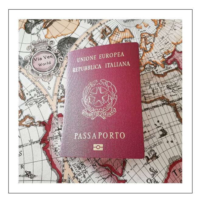
Figure 6. Dunia's post of her new Italian passport.

I have a little bit of conflict now about continuing to post about (the lifestyle) because it does feel a little bit like . . . you know, I'm doing cool things that other people can't do or don't have access to do. And it feels unnecessary to rub it in too much. (. . .) (At the time) I stopped posting it was driven by some amount of like, not quite a guilt, but like, a damage control to avoid potential guilt because it was still COVID (Tom).