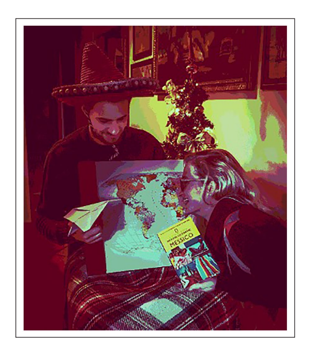
Figure 1. DNs planning next trip to Mexico.