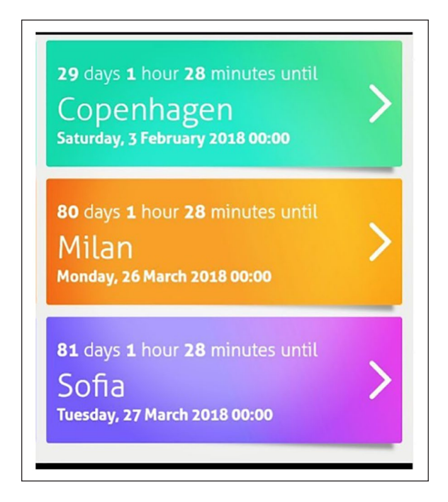
Figure 2. DN's travel schedule.