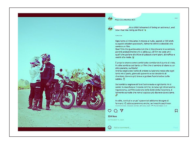
Figure 5. DNs raiders' post showing 'couple goals'.

too?". Despite some participants promoting on Instagram that digital nomadism is a lifestyle anyone can potentially engage in, other participants observed that they have a lot of freedom to move around because of their Western passports. Dunia (who was born in Argentina) chose an Instagram post from 2018 (see Figure 6) showing her new Italian passport (which took her 12 years to obtain) as one of the pictures that represents her as a DN. Even though she became a DN 1 year later, a European passport was a very important milestone in her DN journey since it allows her to travel around the world with lesser restrictions than with her Argentinian passport.