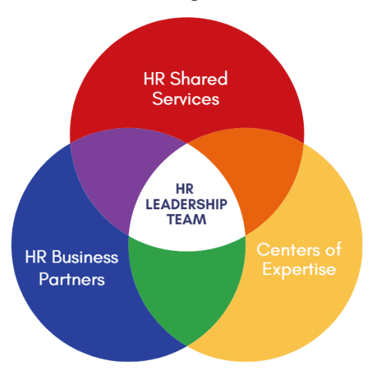
Figure 3. Ulrich's HR Operating Model. Adapted from CFO? CIO? The world needs a CHRO! The future of HR: the Chief HR Officer as strategic partner , by A. van der Laan & S. de Leeuw RE, 2018, Compact (https://www.compact.nl/articles/cfo-cio-the-world-needs-a-chro/). Copyright 2018 by Compact.

shared/business services (GBS) function (Keegan et al., 2018). Ulrich's model is often illustrated such as in Figure 3: