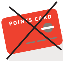
FIGURE 2: Future loyalty program success factors