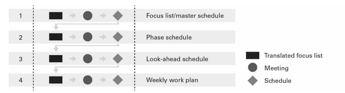
Figure 2: Top down translation of uncertainties.

As you move to the more detailed levels, uncertainty management is more about handling risks, and not so much about exploiting opportunities. The discussion is about constraints and preconditions for sound activities, and not so much about improvements. In Lean terms, the opportunity perspective could be expressed as waste reduction or increase of value. At the level of the look-ahead schedule or weekly work schedule, the focus is mainly on waste reduction. Prior to the phase schedule meeting, look-ahead meeting and the weekly work schedule meeting, the coordinator of the meeting, in preparation for the meeting, needs to translate the focus list from the level above. The owner of the meeting also needs to set the agenda for the meeting at his level. This process is illustrated in Figure 2.