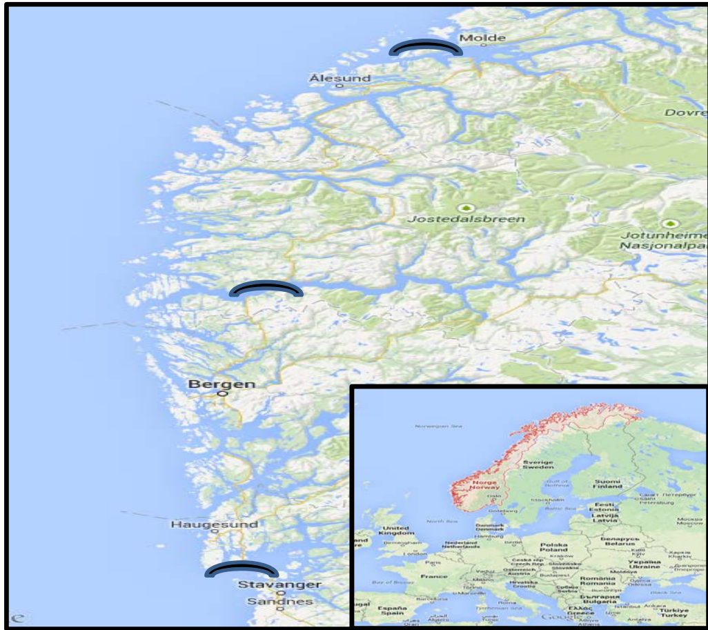
Figure 1: Map of E39 and fjord crossings

The small map on the right hand side indicates the location of Norway within Europe. The larger map is of the West Coast region of Norway. Arches depict the three fjord crossings discussed in this paper. The arch in the bottom indicates the location of the Stavanger-Haugesund crossing over Boknafjorden (Bokna fjord), in the middle the Løvik and Oppedal crossing over Sognefjorden (Sogn fjord), and at the top the Ålesund-Molde crossing over Moldefjorden (Molde fjord).