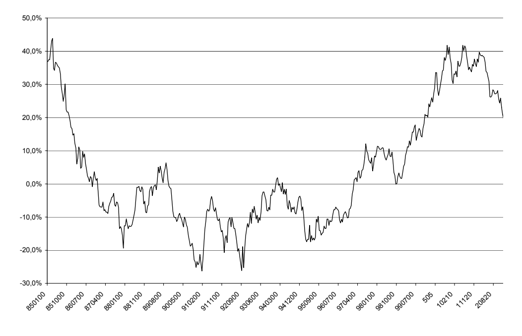
Figure 3. Misalignement of Euro against the USD (in percents)

The second issue is the exact nature of the C function in the chartist regime (equation(17)). Chartists are usually reported to use a complex set of moving average rules leading to heterogeneous strategies across agents. This heterogeneity makes the identification of the agregate chartist forecasting rule quite cumbersome. Since chartist behaviour is not directly observable, there is a large number of admissible specifications for equation (17), which need to be evaluated. The retained specification should be therefore selected on the basis of data adjustment. As a premiminary check, we have estimated simple AR-GARCH models of the following type: