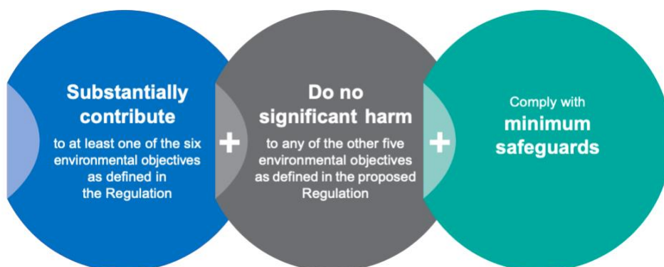
Figure 2: EU Taxonomy requirements for sustainable activities (TEG, 2020b)

Ascertain that the firm conducts responsibly and has minimum safeguards to avoid negatively influencing social stakeholders. For example, if the firm is constructing new buildings in a "greenfield" project, is it doing so in a way that respects the local population's rights and obtains the necessary permissions without instances of bribery and corruption.