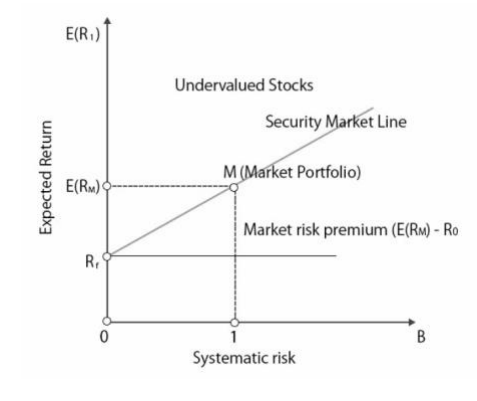
Figure 1: Security Market Line

is called the Security Market Line (SML). It is important to note that the SML applies to both efficient portfolios as well as individual assets.