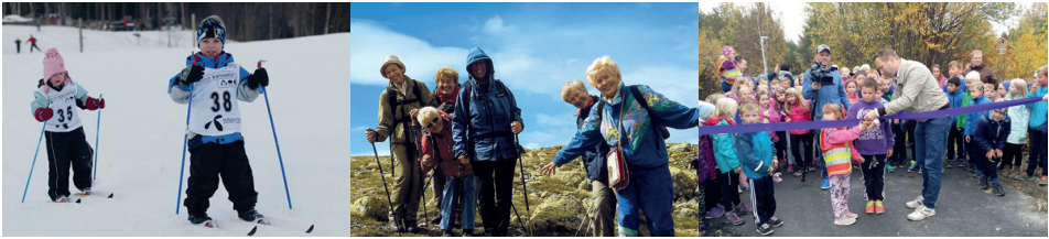
Illustration 4. From the page of the Rollag municipality (NOR). Illustration 5. From the Hammerfest municipality (NOR). Illustration 6. From the Alta municipality (NOR)

Compared to the Danish municipalities, the Norwegians under-communicated utility, and preferred to profile themselves through appeals to pleasure. Practically all of the Norwegian municipal web pages’ visuals showed happy people of all ages, mostly involved in various outdoor activities. Even a relatively everyday and unadventurous event such as the opening of a new cycle and footpath was visualized as a festive ribbon cutting ceremony performed by children in a forestry landscape, rather than an urban scene. Many municipalities also attributed pleasure and fun to senior citizens “på tur” (hiking) in the mountains. Playing on the word “café”, the text heading of this visual also attempts to advertise the exercise programme, “Trimkafeen” (Fitness café), as a leisurely and relaxed social event rather than a necessity.