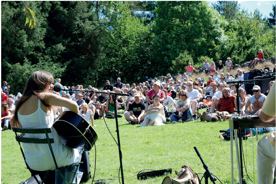
Illustration 2. From the page of the Arendal municipality

Our analysis showed that a discourse of citizen identity is more frequently used visually than textually. The Norwegian municipalities addressed identities through twenty-eight visuals and seven texts. The Danish municipal websites included twenty-three visuals and seventeen texts pertaining to citizen identity. Identities presented visually were usually depictions of citizens engaging in different sorts of activities: