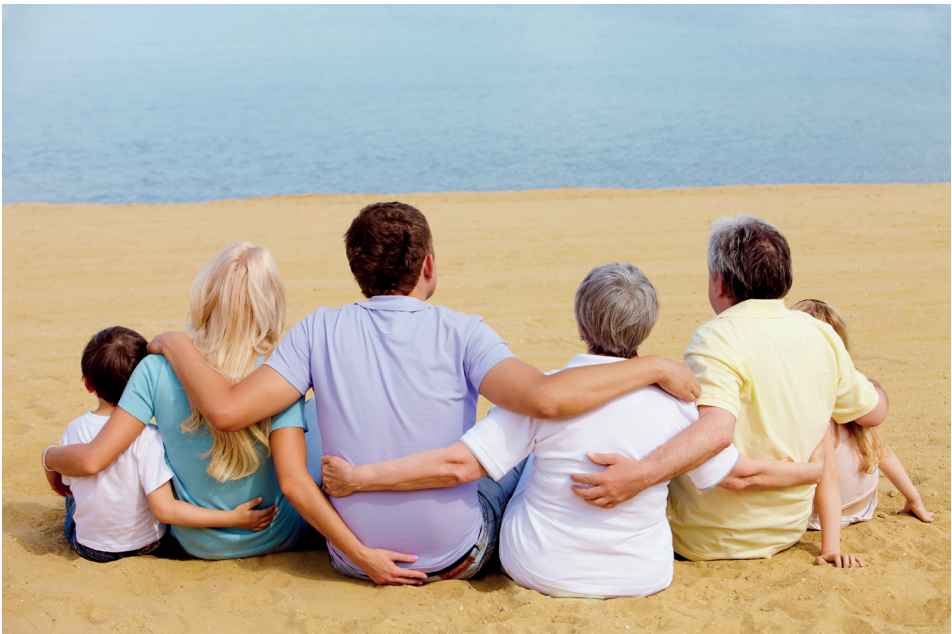
Illustration 7. From the page of the Esbjerg municipality (DK)

Consider a contrasting Danish example where a family is pictured sitting on the beach with their arms around one another. This picture was supported by the following text: “Become a foster or relief family. If, out of the desire of your heart, you want to make a difference for a child? We would like to invite you to an information evening” (Esbjerg Municipality, DK). Without the caption, the picture would alone represent a family together on the beach, which connotes emotions. With the caption, however, we learn and emotionally experience how a compassionate family is lending Esbjerg Municipality a helping hand, thus extending the picture’s inherent connotation.