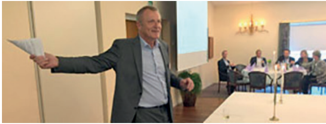
Illustration 3. From the page of the Odder municipality (DK)

Interestingly, our data contained few visuals of the physical meetings between public officials and citizens to portray the building of relationships. In one of these rare instances, we saw the mayor of a Danish municipality meeting, not with ordinary citizens, but with members of the local business community.