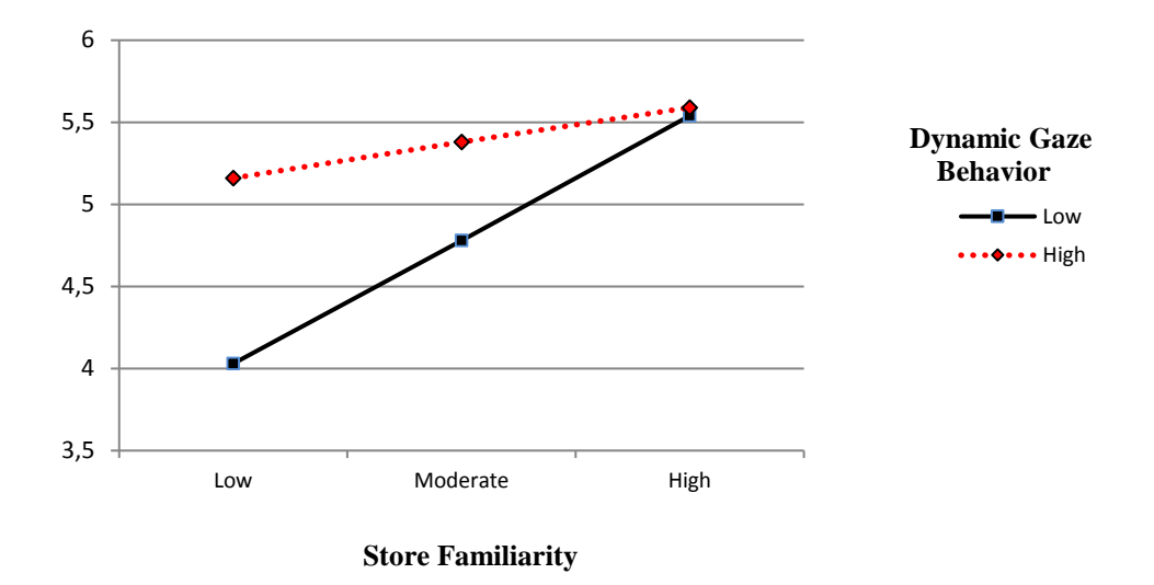
Figure 3: Conditional effect of store familiarity on navigational fluency at one standard deviation below the mean (Low) and one standard deviation above the mean (High) on dynamic gaze behavior.