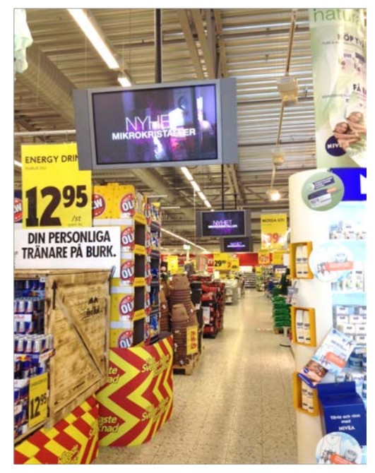
Figure 1: Examples of the digital signs that participants walked past during their shopping task.

At the store entrance, each customer was fitted with a pair of Tobii glasses, and was given an identical shopping list with instructions to collect the products on the list (for example, bread, sandwich spreads, tomatoes, lemons) during a fill-in shopping trip just for those items (cf. Kollat & Willet, 1967; Nordfält, 2005). Sandwich meat, vegetables, and fruit are among the most frequently purchased products in grocery stores (Dove, 2011; Herzig-Marx, 2012), and have well-defined locations; therefore, the selection of these products was made based on the assumption that customers would have a reasonable knowledge of where these products might be found even if they have not been to that particular store before. During the task, participants passed 16 digital signs located in the vicinity of the products they sought (see Figure 1 for an example of the signage). After a calibration procedure of the eye-tracking equipment, recordings of eye fixations began, and participants were sent on their shopping trip. When they had collected the items and reached the checkout, the eye-tracking equipment was removed. Participants then filled out a survey that included providing demographic information, and giving their responses to statements linked to navigational fluency and store familiarity.