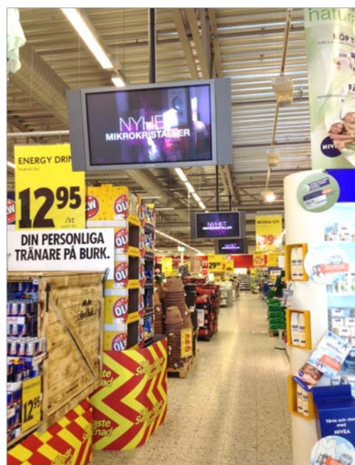
Figure 1: Examples of the digital signs that participants walked past during their shopping task.

At the store entrance, each customer was fitted with a pair of Tobii glasses, and was given an identical shopping list with instructions to collect the products on the list (for example, bread, sandwich spreads, tomatoes, lemons) during a fill-in shopping trip just for those items (cf. Kollat & Willet, 1967; Nordfält, 2005). Sandwich meat, vegetables, and fruit are among the most frequently purchased products in grocery stores (Dove, 2011; Herzig-Marx, 2012), and have well-defined locations; therefore, the selection of these products was made based on the assumption that customers would have a reasonable knowledge of where these products might be found even if they have not been to that particular store before. During the task, participants passed 16 digital signs located in the vicinity of the products they sought (see Figure 1 for an example of the signage). After a calibration procedure of the eye-tracking equipment, recordings of eye fixations began, and participants were sent on their shopping trip. When they had collected the items and reached the checkout, the eye-tracking equipment was removed. Participants then filled out a survey that included providing demographic information, and giving their responses to statements linked to navigational fluency and store familiarity.